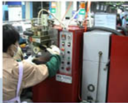
作為補膠機為滾輪機供膠

Spiral spray on rubber outsole /stock fitting